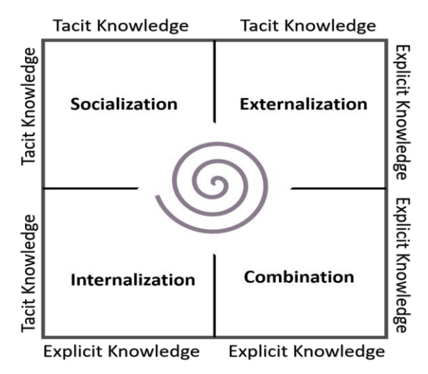
Fig. 1. Example The SECI model (Nonaka et al., 2000).

developing a coherent process of dynamic knowledge creation between each individual user and IT/AI processes embedded in a smart grid. According to [1], two kinds of knowledge can be conceptually distinguished along a continuum: (1) Tacit knowledge, which is non-verbalizable, intuitive, and unarticulated, involves nuanced comprehension, relies upon know-how and wisdom accumulated from collaborative experience, and is thus difficult to formalize; and (2) Explicit knowledge, which is predominantly codified.